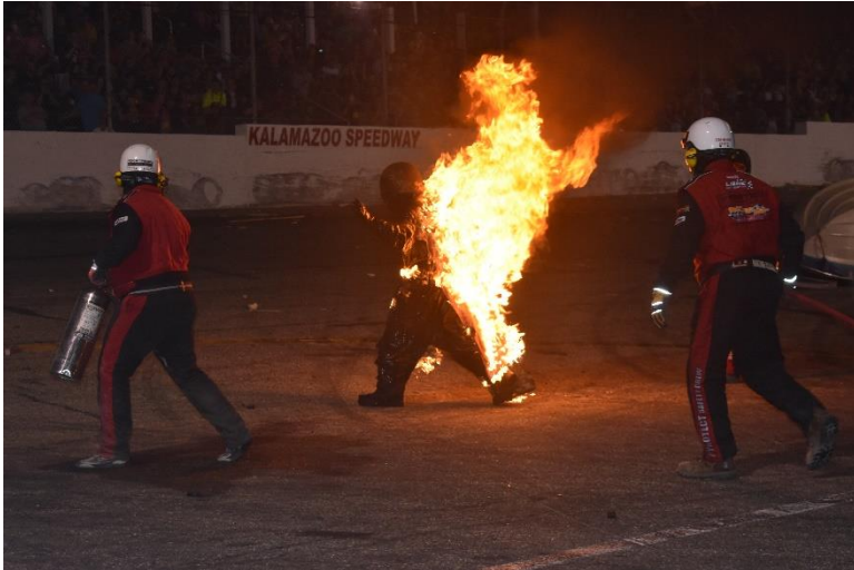
And before the Speedway set off its fireworks, which concluded with a big fire bomb, Scarecrow and his motorcycle fired off their own pyrotechnics (with Kalamazoo Track and Safety close by).