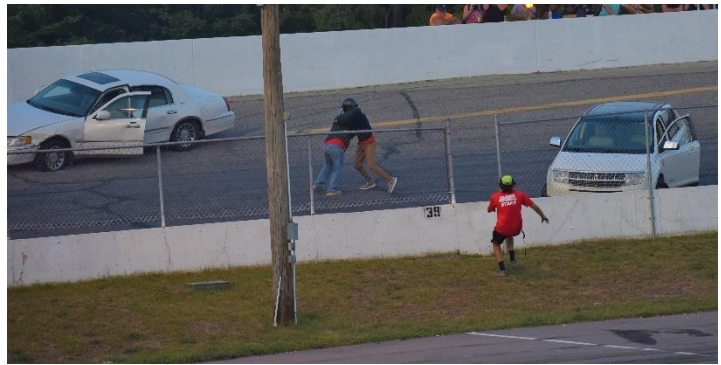
At left, a monster truck photo opportunity. Above, a bit of a dust up on the backstretch during the Spectator Drags.