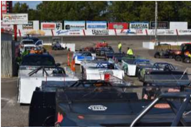
Top Row: Cars lined up for the main event – Super Shoe XXXIV and then took to the oval. Waiting for payout and packing up.