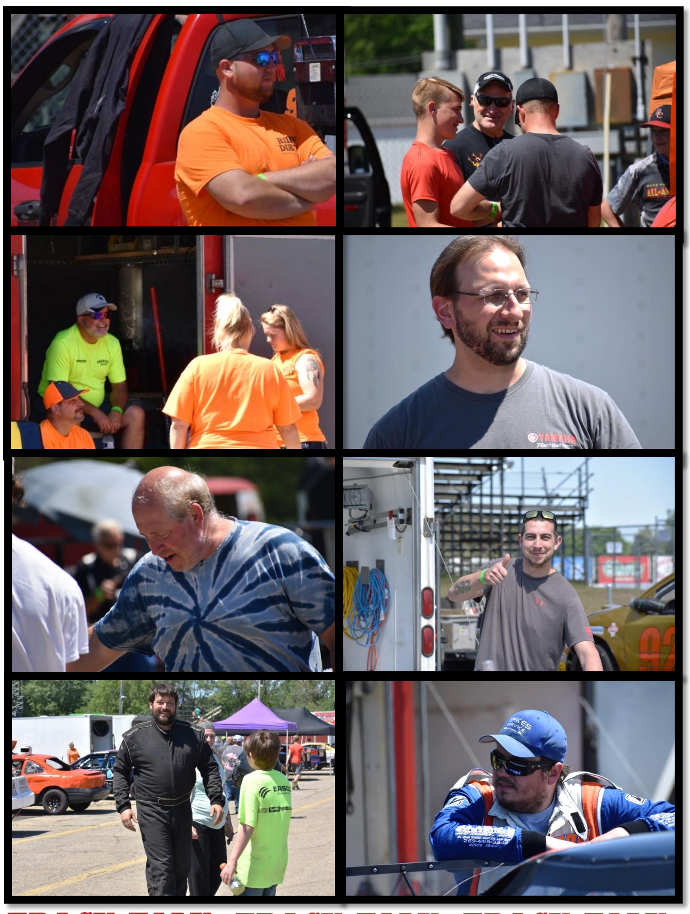
TRACK TALK TRACK TALK TRACK TALK