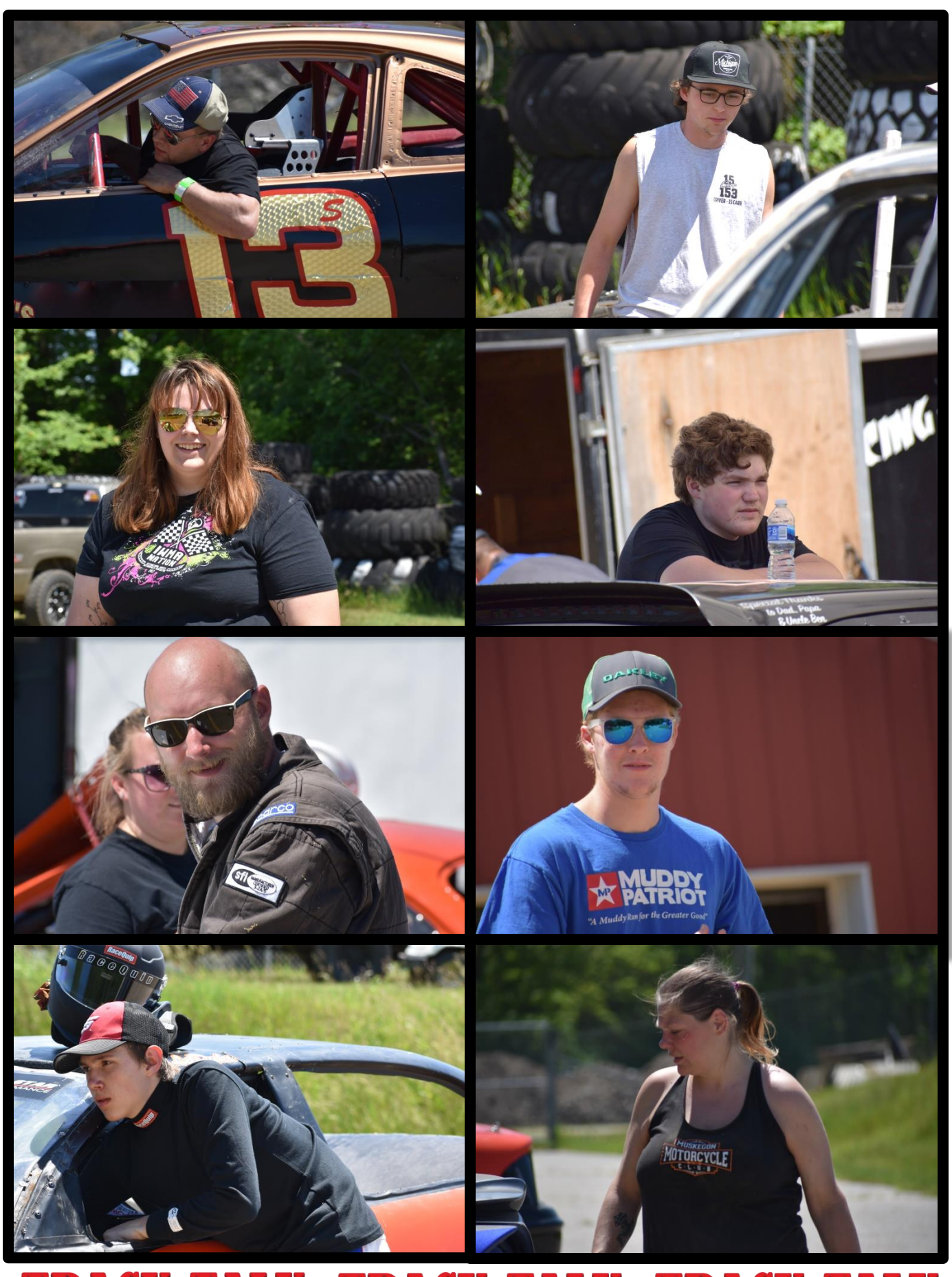
TRACK TALK TRACK TALK TRACK TALK