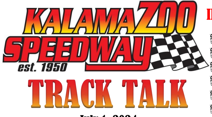
July 1, 2024