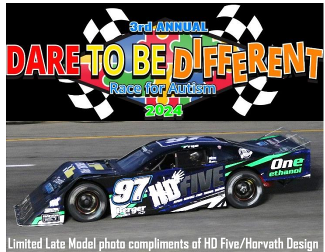
Limited Late Model

THE SEASON OPENER is always a big night at Kalamazoo Speedway and this year is no exception. This year's four weekly classes will race at the 74 th Season Opener. Returning are the AFC Metal Supply Late Models and the Techworks Trailers Street Stock. Back for the first time since the close of 2006 are the Honor Credit Union Outlaw Limited Late Models (pictured to the right). The Front Wheel Drives are now one class with two divisions (those racing on Hoosiers [O'Reilly Auto Parts] and those running on street tires [Spartan Insulation]). Each division will crown a champion. All front wheel drive cars with qualify together as a single class. April 19 also marks the 3 rd Annual Dare to be Different Race for Autism for the Front Wheel Drive - DOT division. All classes and divisions will race to win $1,000 in the 'A' feature. The Autism Awareness race will pay $150 to start for the 'A' feature.