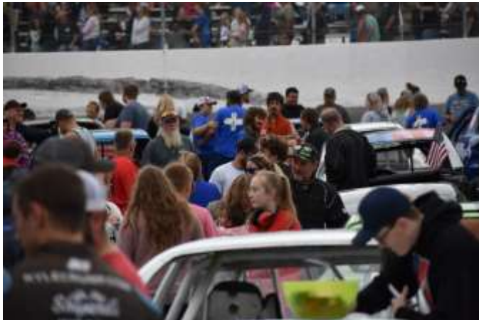
July 30 Autograph Night.