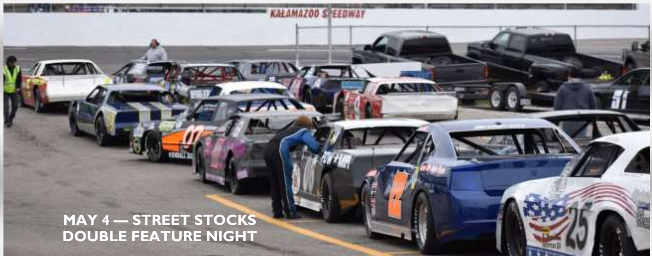
MAY 4 — STREET STOCKS DOUBLE FEATURE NIGHT