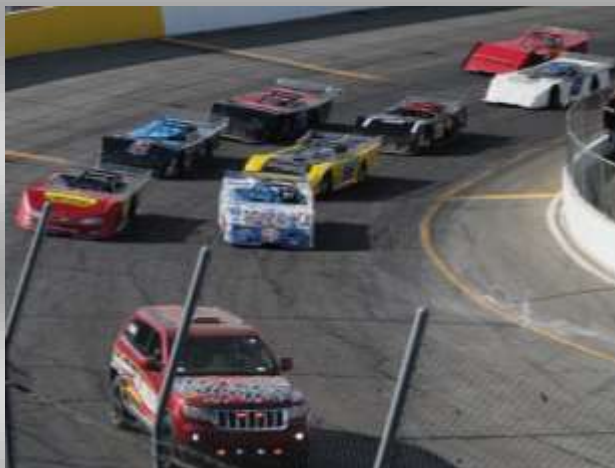
Pictured, the start of the Super Shoe Nationals XXXI, won 75 laps later by Jeff Ganus.