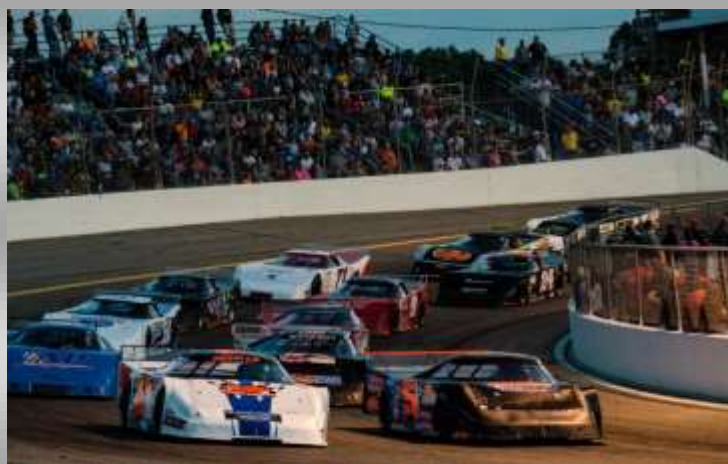
Kalamazoo Klash XXV