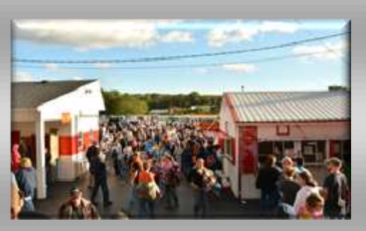
Only 100 more days until opening night!!