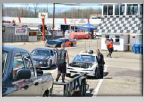
HAPPY NEW YEAR!!!! First open testing/practice in 86 days!