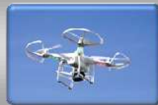
Newest member of the Speedway family

For now, you can call me Peter Pan, because I'm tired of being called "the drone", but don't be calling me Tinkerbell! I'm a kid at heart, not likely to grow up and I can go places you can't. I can pan over long distances and take video and stills. I haven't gotten tangled up in the wires crisscrossing the track yet (I hear you all wondering when that will happen) and I do make a quiet whirring noise if you listen when I'm close by. When all is said and done, I'm going to deliver some magnificent shots of the track and of the racing action!