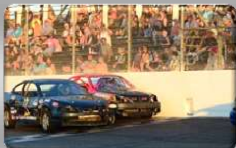
It was that close!