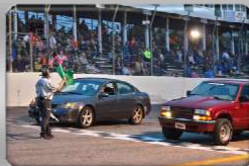
Rick Beebe, Flagman, lined up two of the competitors during the May Spectator Drags.

Admission: Adults $12, 13-15 $8, 6-12 $2 and 5 and under FREE Free parking. Bring your own cooler of food & beverage or use the reasonably priced Speedway concessions.